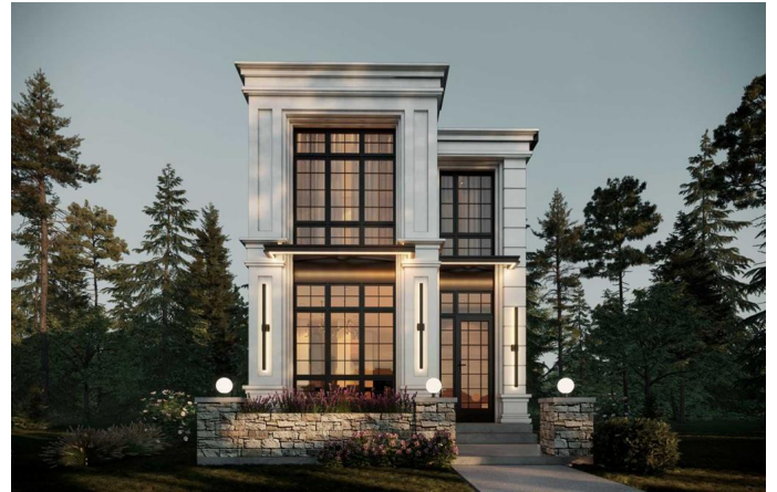
1623 21 Avenue NW (West)

Discover luxury and functionality in this spacious detached infill, nestled in the desirable community of Capitol Hill. Built by the award-winning ACE HOMES, this home sits on an impressive 27.5-foot WIDE LOT, offering over 3,000 SQFT of developed space that combines contemporary design with thoughtful details. With a total of 5 BEDROOMS, this home is ideal for families, multi-generational living, or those looking for rental potential. The layout includes 3 bedrooms upstairs and a 2-bedroom LEGAL BASEMENT SUITE with its own entrance. The main floor is designed for both elegance and convenience, featuring a dedicated dining room, a POCKET OFFICE, a walk-in BUTLERS PANTRY with a prep sink and beverage fridge, and a SOUTH-FACING LIVING ROOM that fills the space with natural light. A spacious mudroom and powder room add to the home's functionality. Upstairs, you'll find a large primary suite with a VAULTED CEILING, a custom COFFEE BAR, and a 5-piece ensuite with upscale finishings. Two additional bedrooms, each with tray ceiling details and their own 3-PIECE ENSUITE, provide a perfect balance of privacy and comfort for family members or guests. The legal basement suite, with separate mechanical room access, is fully equipped with a modern kitchen, including a fridge, dishwasher, OTR microwave, and range, along with IN-SUITE LAUNDRY. The basement's two bedrooms share a full