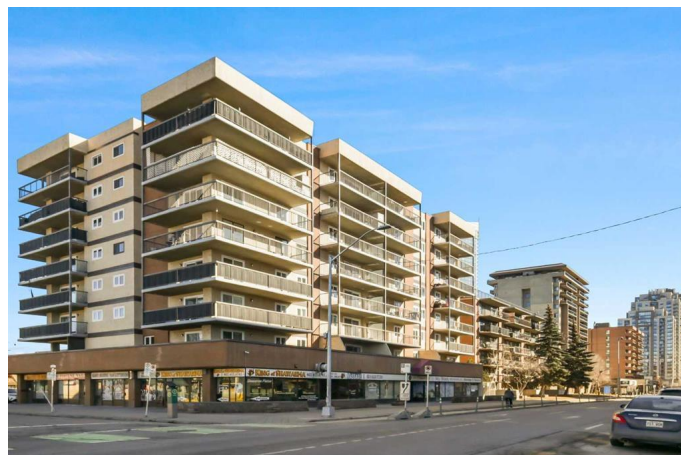
502, 1334 12 AVENUE SW RECA MEASUREMENT STANDARD - CALGARY AB MAIN LEVEL (AG) - 901.32 Sq Ft / 83.73 m 2 TOTAL ABOVE GRADE RMS SIZE - 901.32 Sq Ft / 83.73 m 2

**Hold on to your Hat** Value!!! Shop & compare. Indoor parking! Plus, 2 months prepaid condo fees! Views overlooking the downtown and the west side. This is the most popular model/floor plan with 900 square feet in the sought-after "The Ravenwood" concrete building with two bedrooms, a bathroom, one indoor heated parking space, newer countertops, an oversized covered balcony, and a remodeled kitchen & modern design. Additionally, the property features upgraded laminate flooring (no carpet), in-suite laundry, newer windows, bathroom fixtures, and appliances. Large Primary bedroom with a closet. Titled parking in a secure, heated underground parkade. You are also within walking distance of anything you need, with the Sunalta LRT just minutes away for added convenience. Close to Sunalta Elementary School, Connaught School, and West Canada High School, the Bow River pathway offers access to medical facilities, shopping, grocery stores, coffee shops, and much more. QUICK May 01, 2025 possession is available - ACT FAST! You can call your friendly REALTOR(R) to book you viewing.