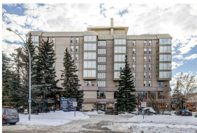
204-4063 Varsity Dr NW, Calgary, AB